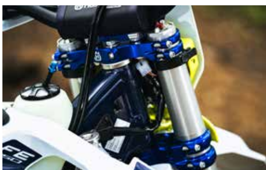
2620199902168 blue | 79101999021C1A black